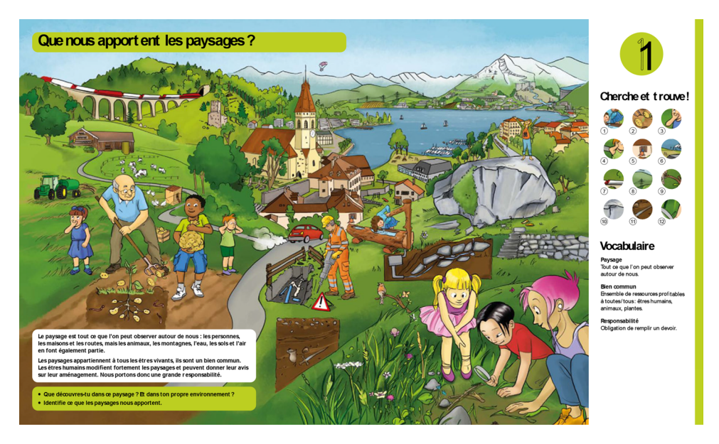
Figure 2. An example of a picture book page.

Finally, such a picture book requires solid training for the teaching staff, whether it be on the qualities of the landscape, on the investigative approach, on the posture to adopt or on the management of class interactions. Indeed, the teachers who were partners in the research highlighted difficulties in going beyond a simple and linear reading of the picture